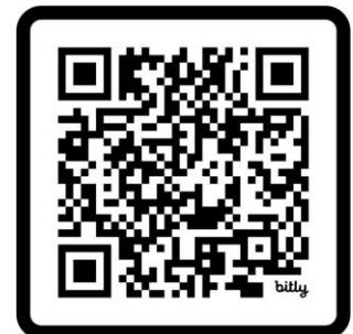
Thriving at Thornton Facebook Group